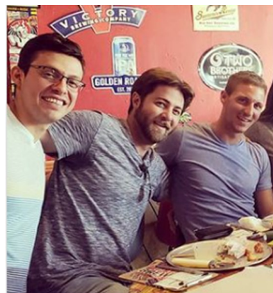
PGY-3s (during their intern orientation, pre-COVID) who are now half-way through!