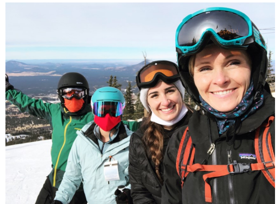
Residents spending time together outside the hospital.